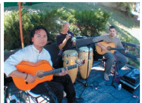
Villa del Sol performs May 1 st at Testarossa

The series runs through September 4 th . Club Testarossa Members may call 408-354-6150 x22 to reserve a picnic table.