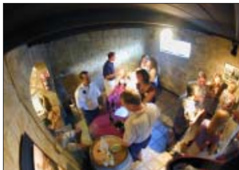
Club Testarossa Members enjoying a members-only event.

Futures: Offered on Futures through 2/28/05.