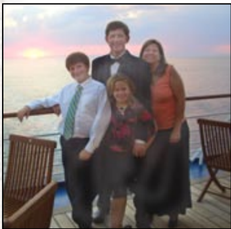
2005 Testarossa Wine Cruise