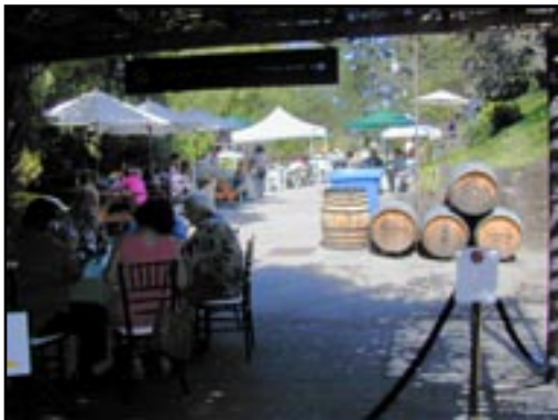
Club Testarossa Summer Barbecue June 2005