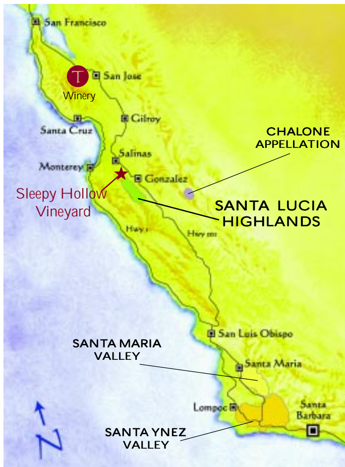
California Central Coast

"Stylized and ripe, this has the sort of intense blackness pinot can take on in Gevrey"