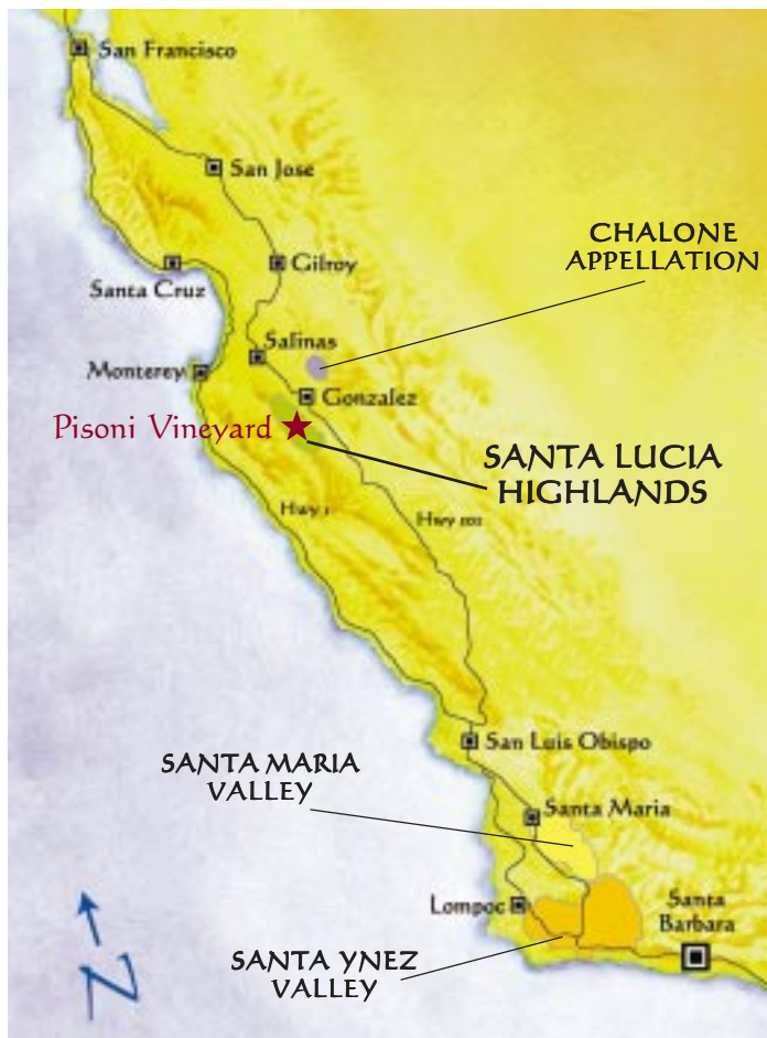
California Central Coast