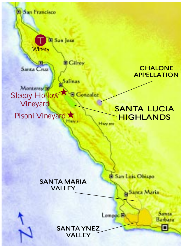
California Central Coast

"Extravagant richness; long on character"