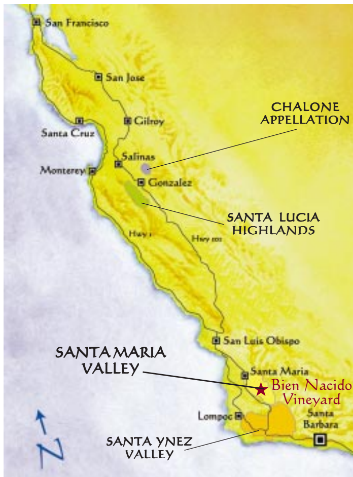
California Central Coast