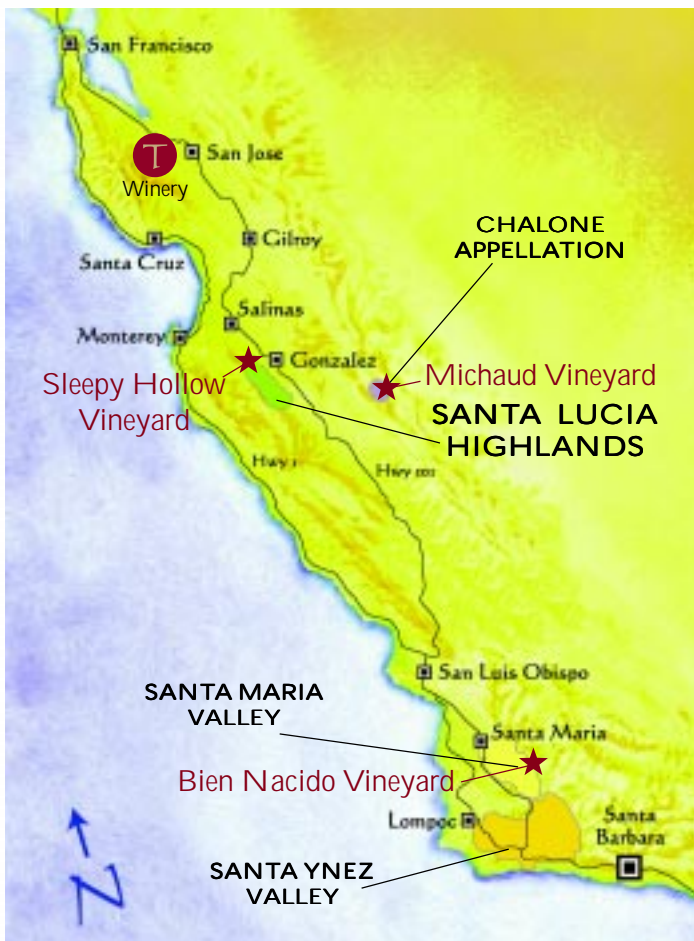
California Central Coast