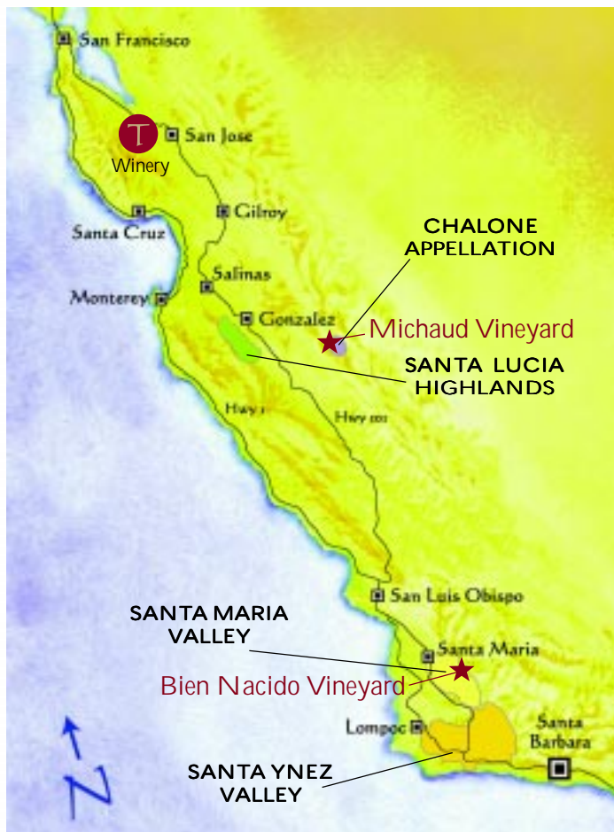
California Central Coast

Robert Parker's Wine Advocate, August, 1998