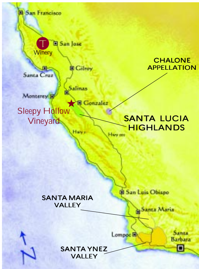
California Central Coast