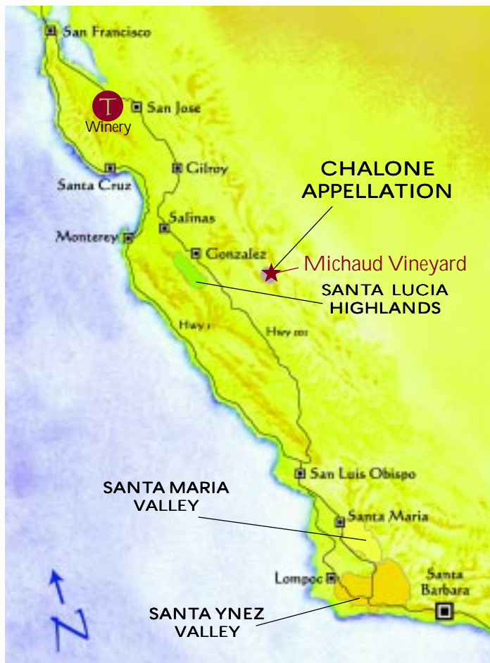
California Central Coast