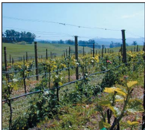
La Cruz Vineyard — April 2005

with the fabulous fruit from this vineyard. If you like full-bodied, full-throttle, big, ageable Pinot Noir, then Testarossa's 2004 La Cruz Vineyard Pinot Noir will give you all that wrapped in a black cherry, smoky, toasty embrace.