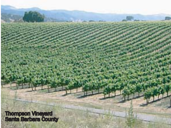
Thompson Vineyard Santa Barbara County

"Syrah and Syrah-based wines from California are seeing an upsurge in quality."