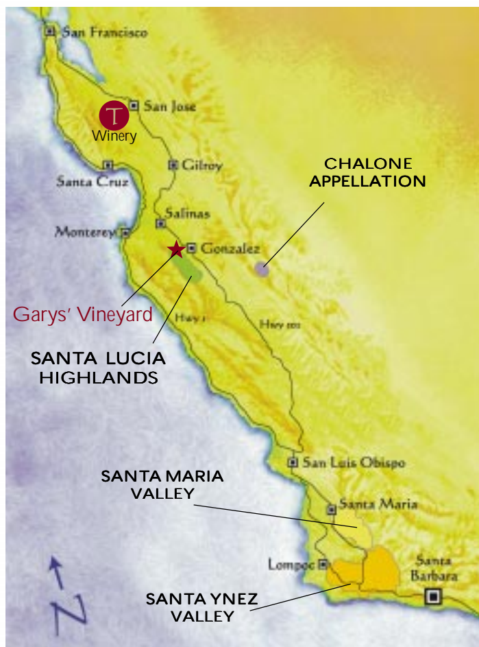
California Central Coast