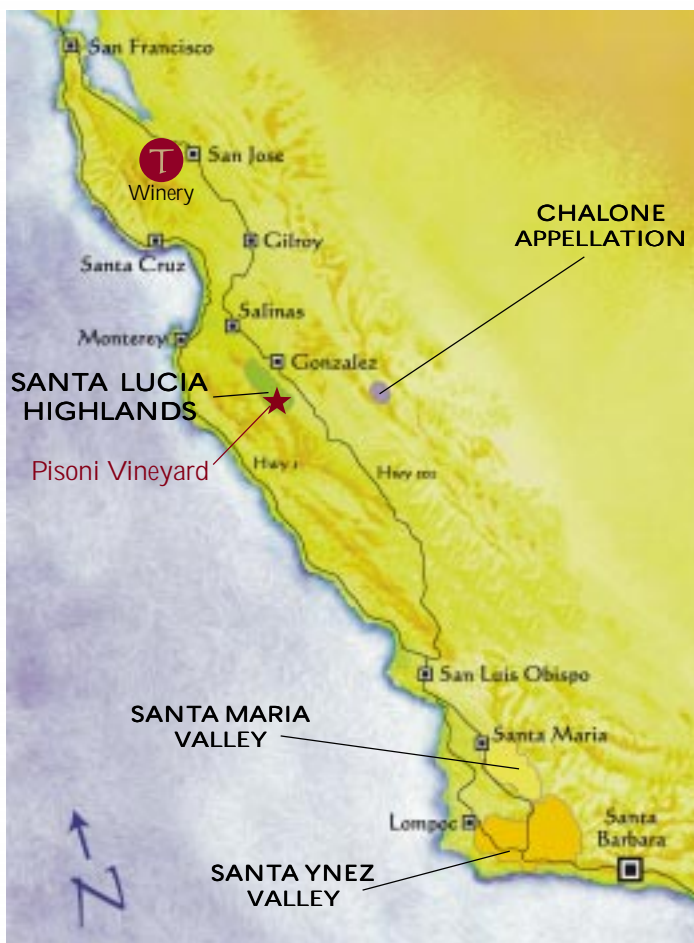
California Central Coast