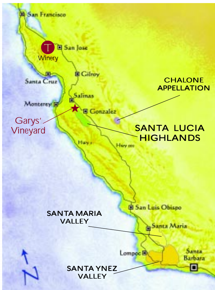
California Central Coast

"One of the most impressive wines from my recent tastings of red burgundies. The fruit for this rich concoction comes from the Santa Lucia Highlands south of Monterey. Very juicy indeed."