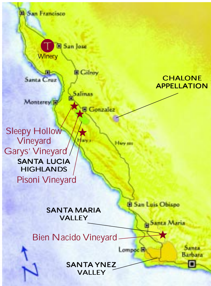
California Central Coast