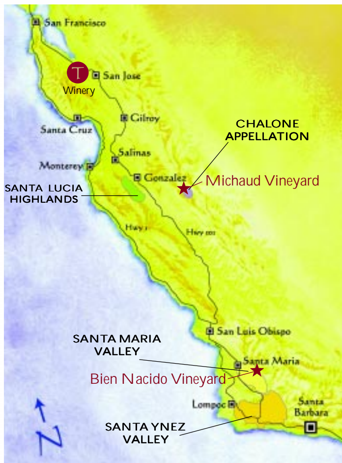
California Central Coast