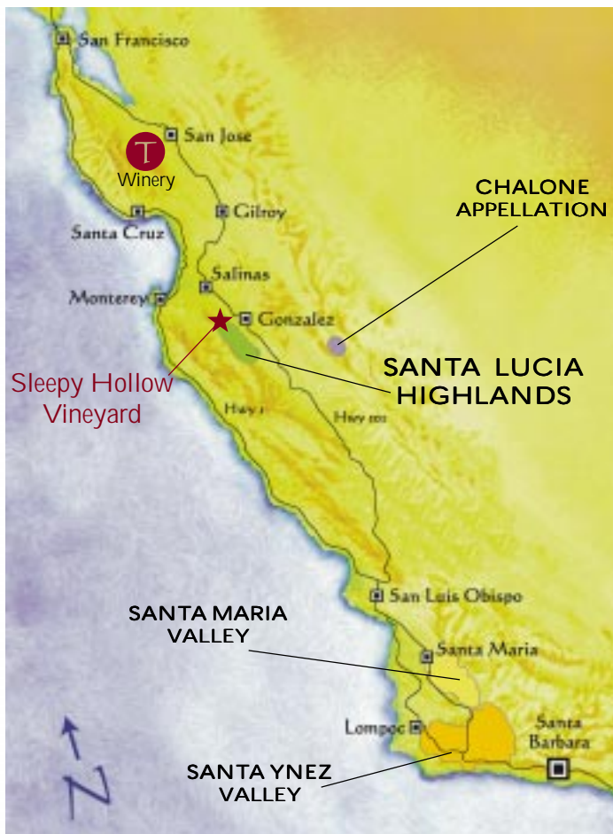
California Central Coast