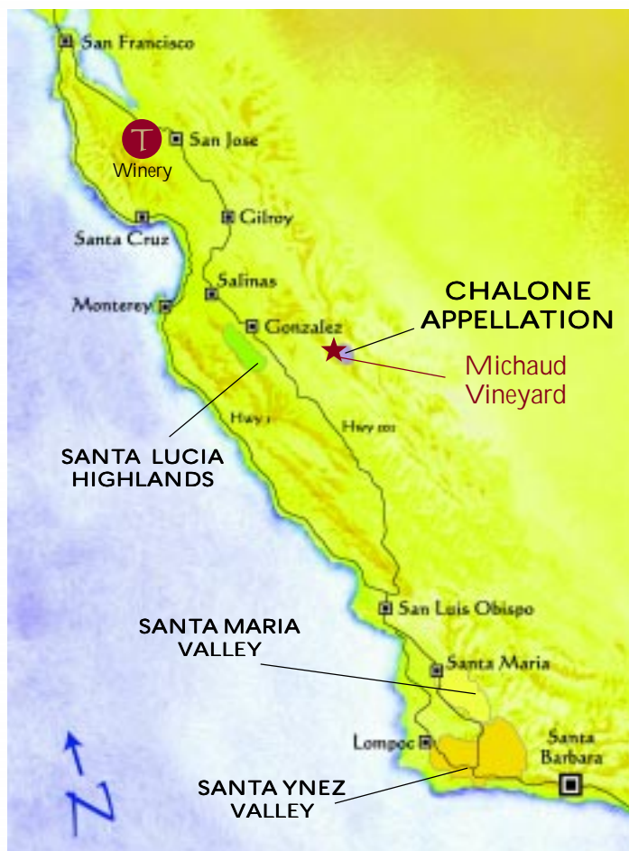
California Central Coast