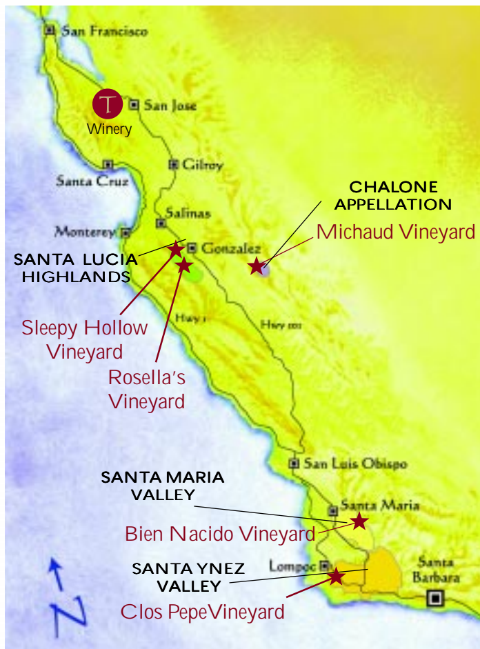
California Central Coast