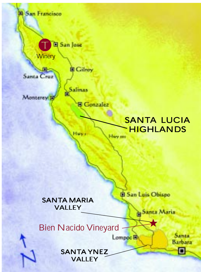
California Central Coast